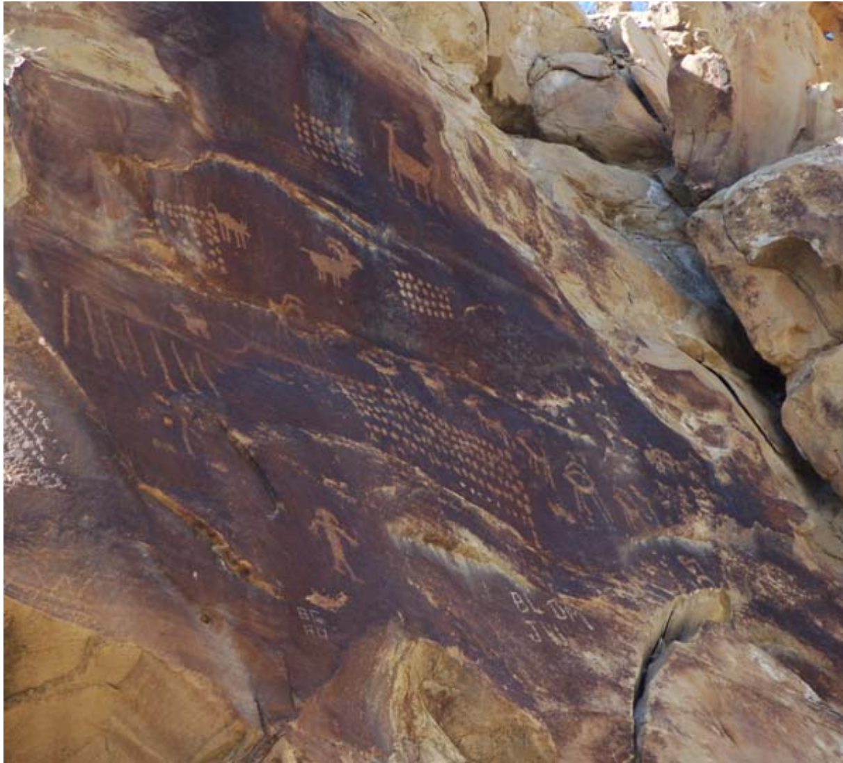
An ancient lattice database?: Nine Mile Canyon, Utah, USA (ca 1200 CE)